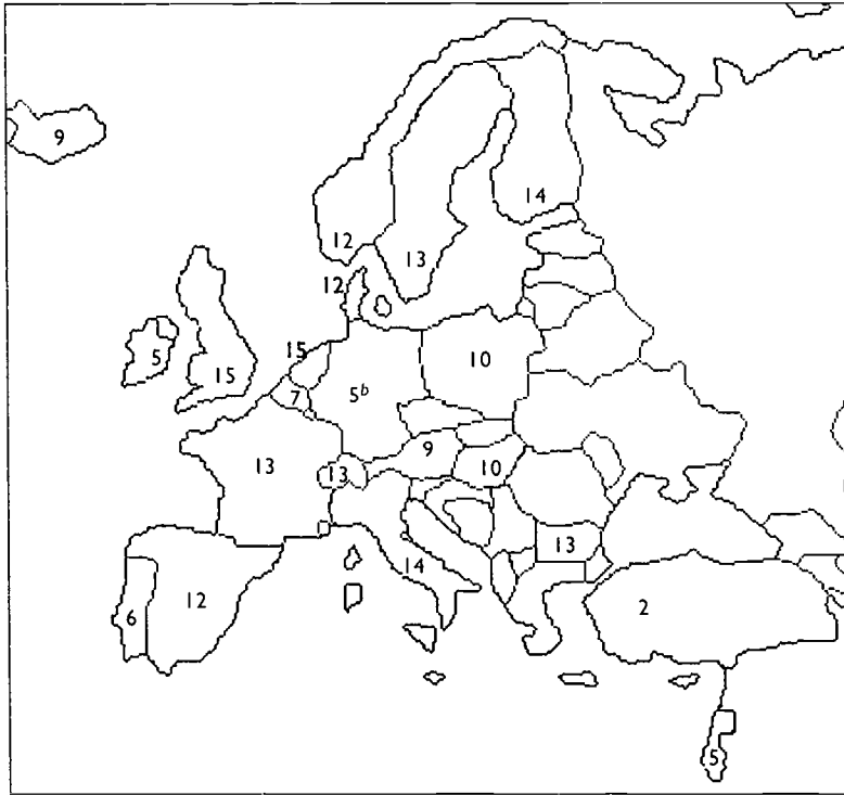
Fig. 1. Coverage of health for all indicators through health interview surveys in countries of the European Region, 1990 (total number of indicators = 17) a